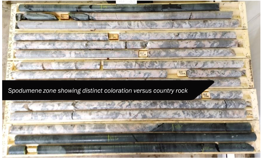
Spodumene zone showing distinct coloration versus country rock