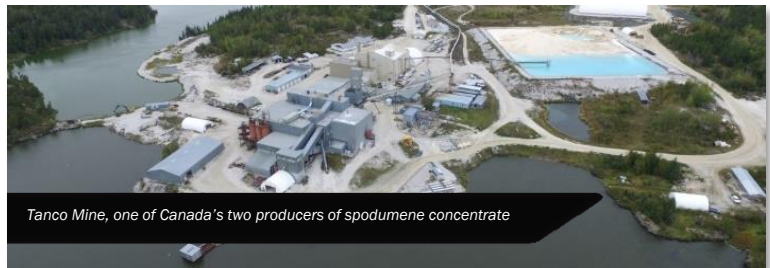
Tanco Mine, one of Canada's two producers of spodumene concentrate