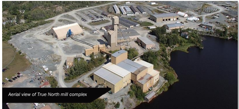
Aerial view of True North mill complex