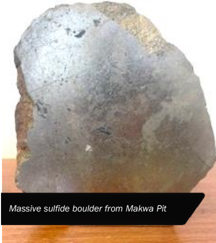
Massive sulfide boulder from Makwa Pit

Grid controls a dominant land position in the highly prospective Bird River greenstone belt with a direct comparison to the “Ring of Fire”. Assays remaining pending at the 100%-owned Mayville project, and the Makwa project is funded through an agreement with Teck Resources.