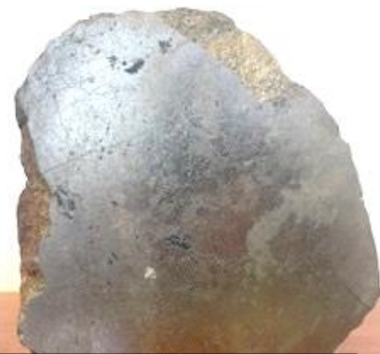
Massive sulfide boulder from Makwa Pit