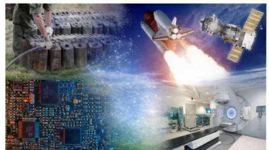
Petroleum Exploration, Aerospace, Military Applications: Atomic Clocks & GPS, Electronics, Medical Imaging Equipment

“Cesium is a high-value, rare metal that is designated a critical mineral by the U.S. and Canada”